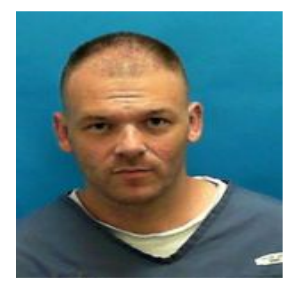
Offense Code OH1644949

Location Details 5923 Runkle Ave, Ashtabula, OH 44004-7718