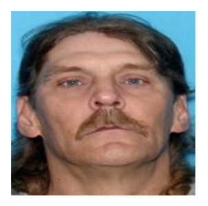
Offense Code FL69762