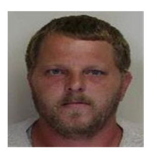
Charge/Offense Contact sheriffs office.

Charge/Offense 2907.02 - rape - >sexual motivation.