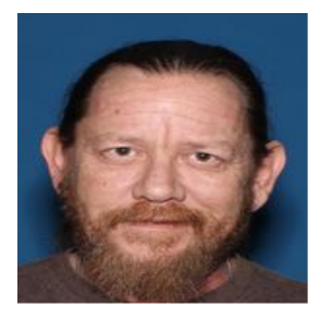
Offense Code OH6736718